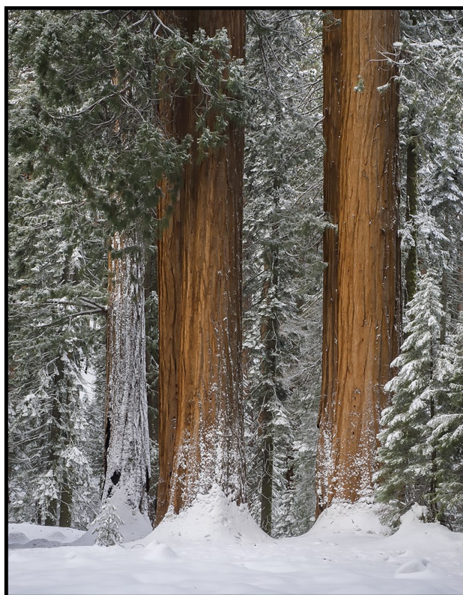
Quiet Trio by John Greening

The picture was shot with an Olympus EM-1 on a tripod with an Olympus 12-40mm 2.8 lens. Settings were ISO 200, at 1/25 sec, and f/13. The RAW file was first processed in Lightroom with a small amount of Clarity and Vibrance added followed by some small adjustments to the Tone Curve. Final adjustments to assure an appropriate whiteness for the snow were done in Photoshop.