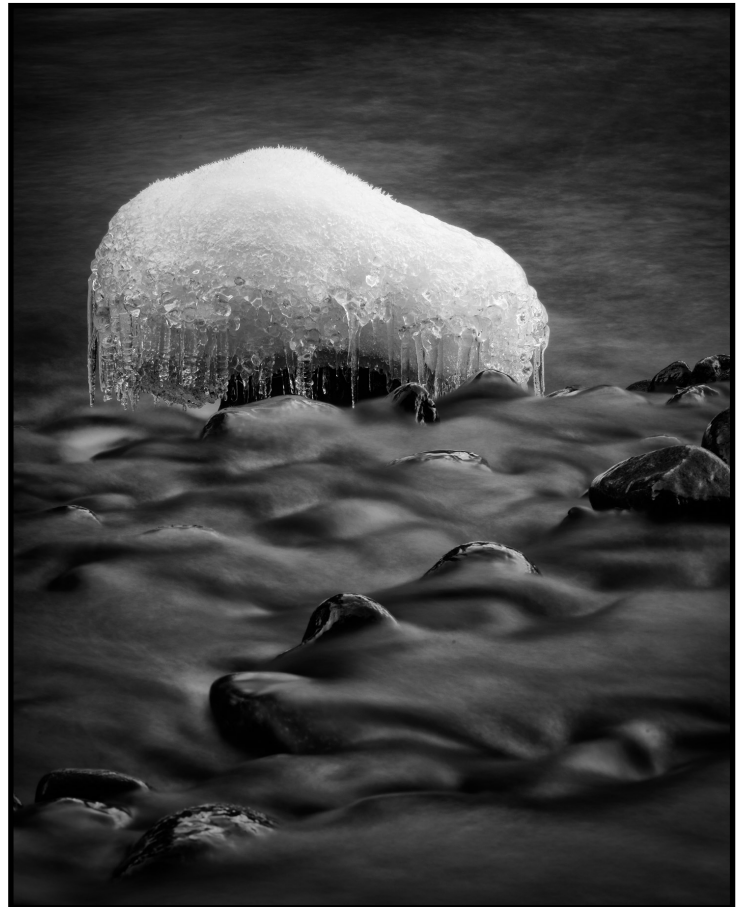
Snowcap on the Merced

Equipment used was a Nikon D800E and a Nikkor 70-200 f/2.8 lens. Manual exposure. Focal length was 200mm, exposure 10.0 seconds at f/22. It was a single shot, not bracketed. I wanted to drag the shutter to capture that silky water movement. Post started with basic RAW adjustments in Lightroom, finish work in Photoshop and NIK. NIK Silver Efex Pro 2 used for the Black & White treatment.