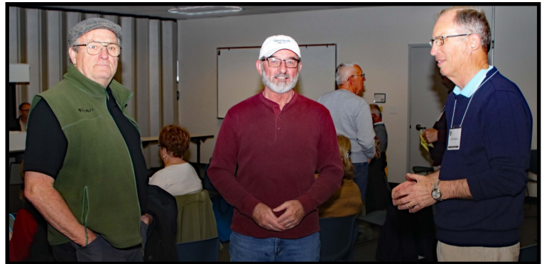
Images from the meeting