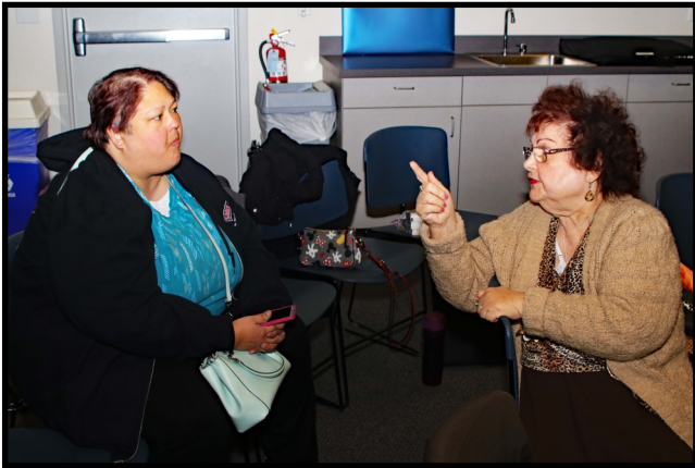
Images from the meeting