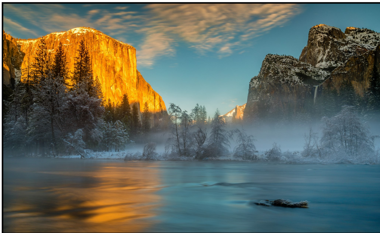
Yosemite Sunset