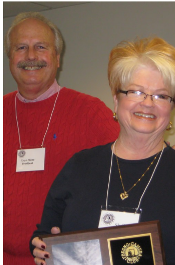
Best Monochrome Print "Death Valley Dunes" Shelley Stone