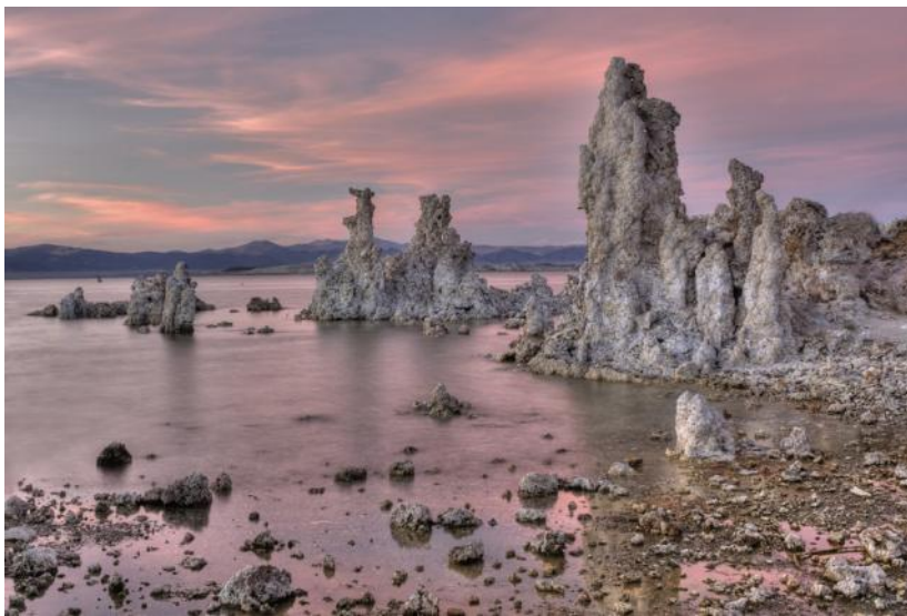
Fresno Camera Club Award—Best Scenic “Mono Lake at Dusk”