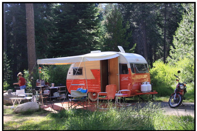
Camping at Huntington Lake

Vacation time is here, the mountains and Huntington Lake (at a cool 7,000 foot elevation) are beckoning me and my family. A week of camping, boating and photographing those pesky Osprey will keep me busy doing things that I like to do. Lately, after my vacations, I find that I need another vacation to relax! Send Elizabeth some of your vacation photography stories for interesting reading in the Highlights, we all want to hear of your exploits.