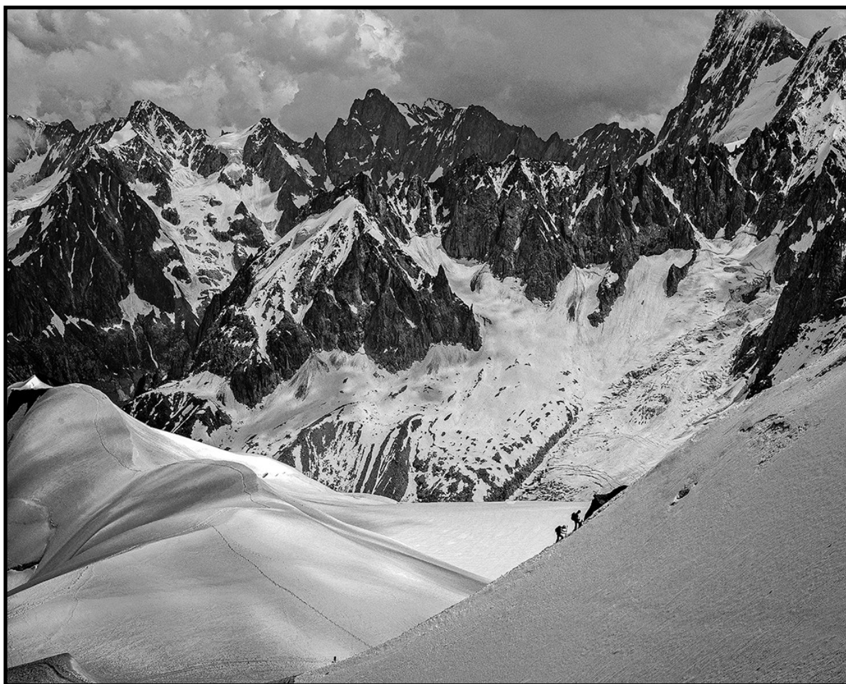
Climbers