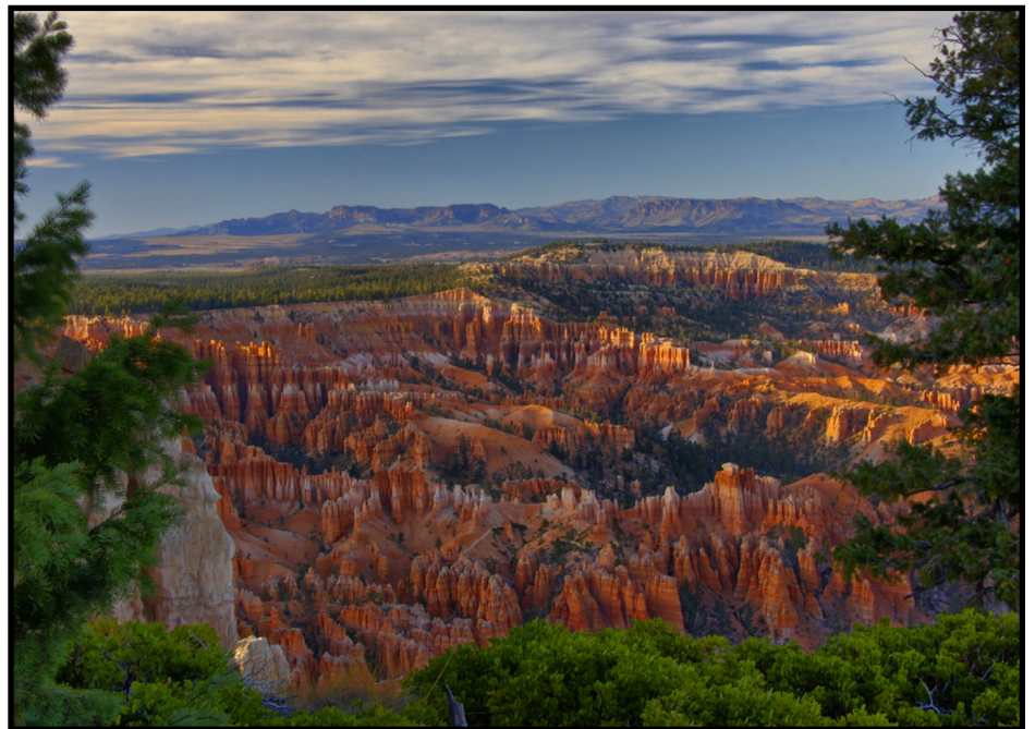
Early Morning Bryce Canyon by Loye Stone