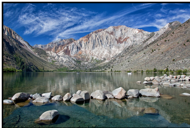
Convict Lake by Dee Humphrey

While on a 4 day road trip down hwy 395 there are several interesting stops to take photos. This was taken at Convict Lake mainly known for it's fishing. It has a nice campground and water rentals.