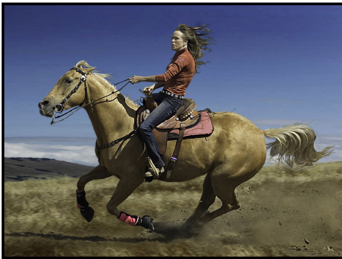
Wind Velocity by Carol LaGue

One of the greatest challenges I have experienced doing horse photography are cluttered backgrounds that distract from The horse & riders. This image is a composition of 2 separate pictures. The foreground is a horse and rider doing a timed speed run. The background is of a local foothill area on a clear day. Photoshop was used to combine and blend photos. I used motion blur on the background and made it a layer. Then I selected the part of the horse and rider as close as I could with small amounts of the original background that I wanted to keep and moved it into the background layer. Then I worked on the photo at a pixel view to erase the existing background from the horse & rider layer and blend the two photos together. Creating a beautiful horse and rider in a pleasing background. This image was taken with the same equipment and settings as No Pain, No Gain .