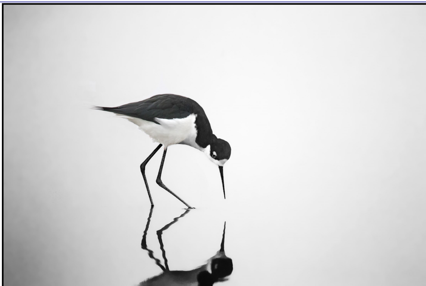
Black Necked Stilt