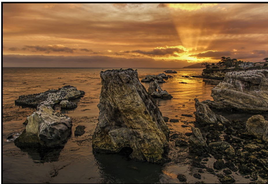
Shell Beach