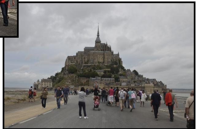
Before Color Efex Pro