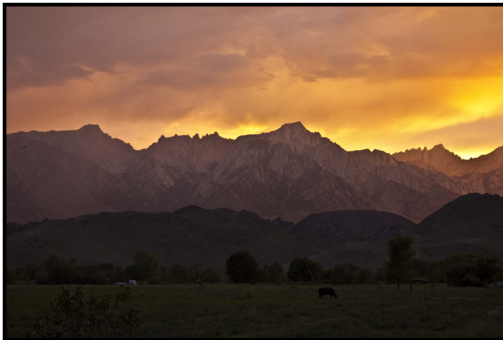
Image 5-Mt Whitney from Lone Pine

from Lone Pine (image 5). Although thunderstorms made our backpacking trip more challenging, they gave us opportunity to see beautiful colors of the Sierra Nevada. For more images about this trip, please go to my Flickr account: http://www.flickr.com/photos/thelinvision/sets/72157634899280616/