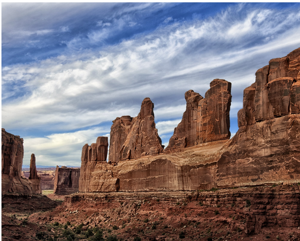
Park Avenue, Arches National Park