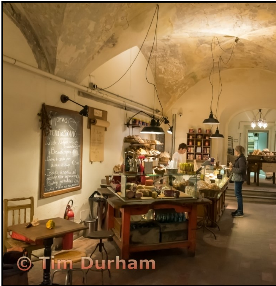
Forno Bakery Florence Italy