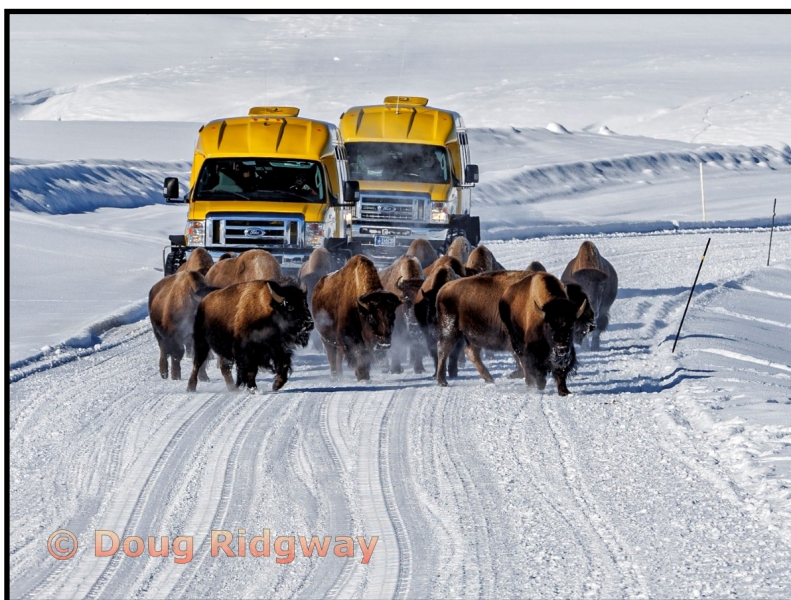
Herding the Bison