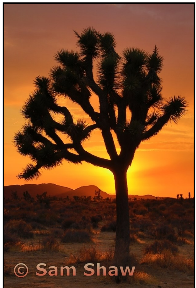
Sun Setting Behind Joshua Tree in Joshua Tree National Park