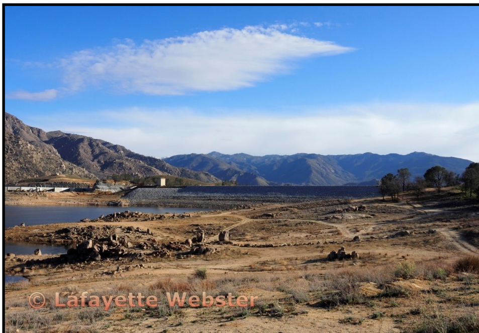
Isabella Dam by Lafayette Webster