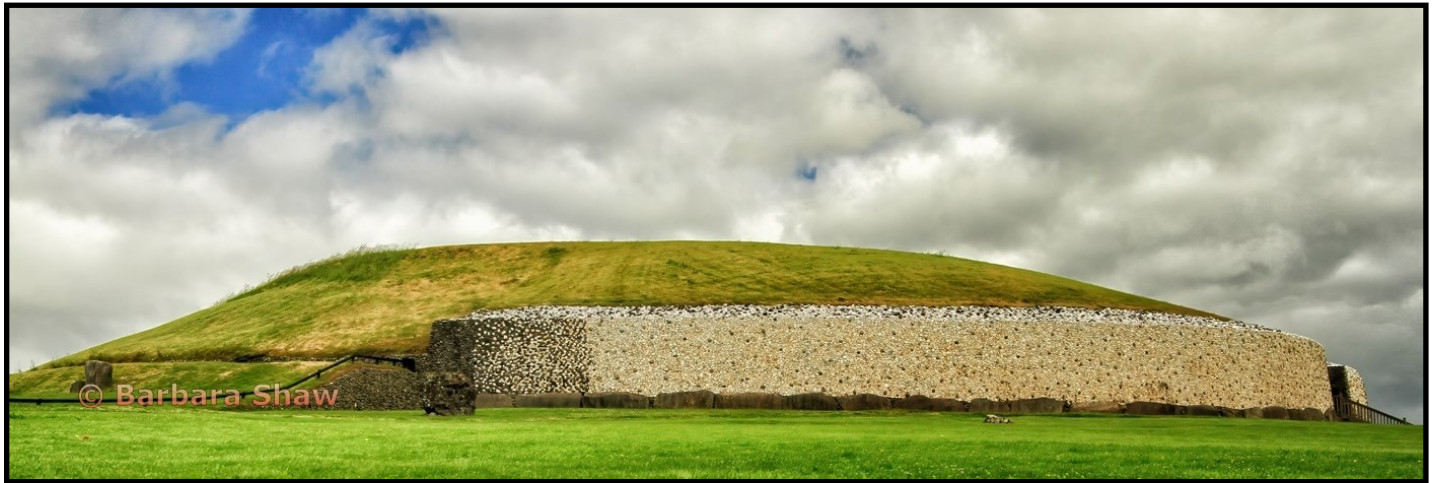
New Grange—Ancient Site Ireland