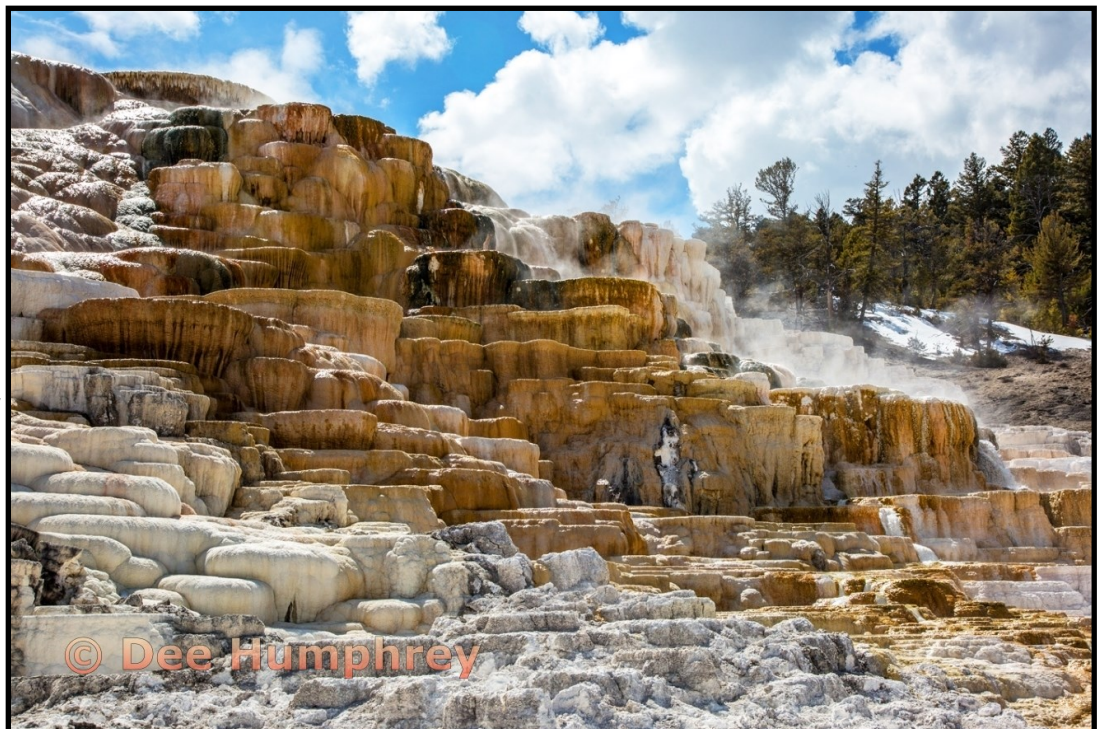
Mammoth Tiers Yellowstone