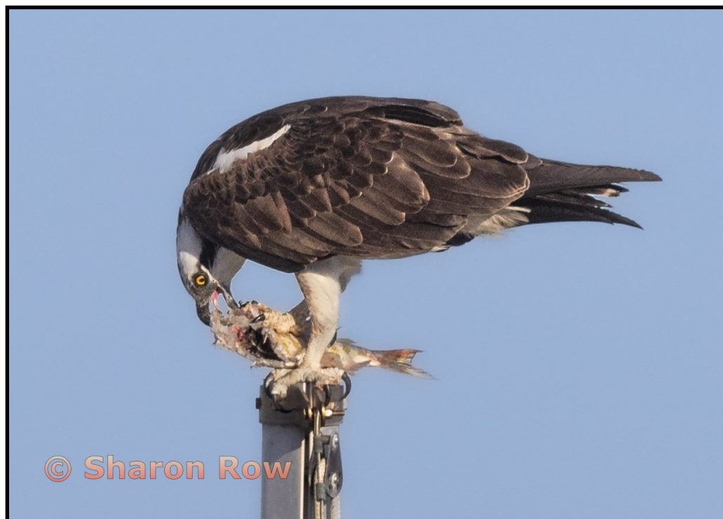
Osprey Perched on Pole