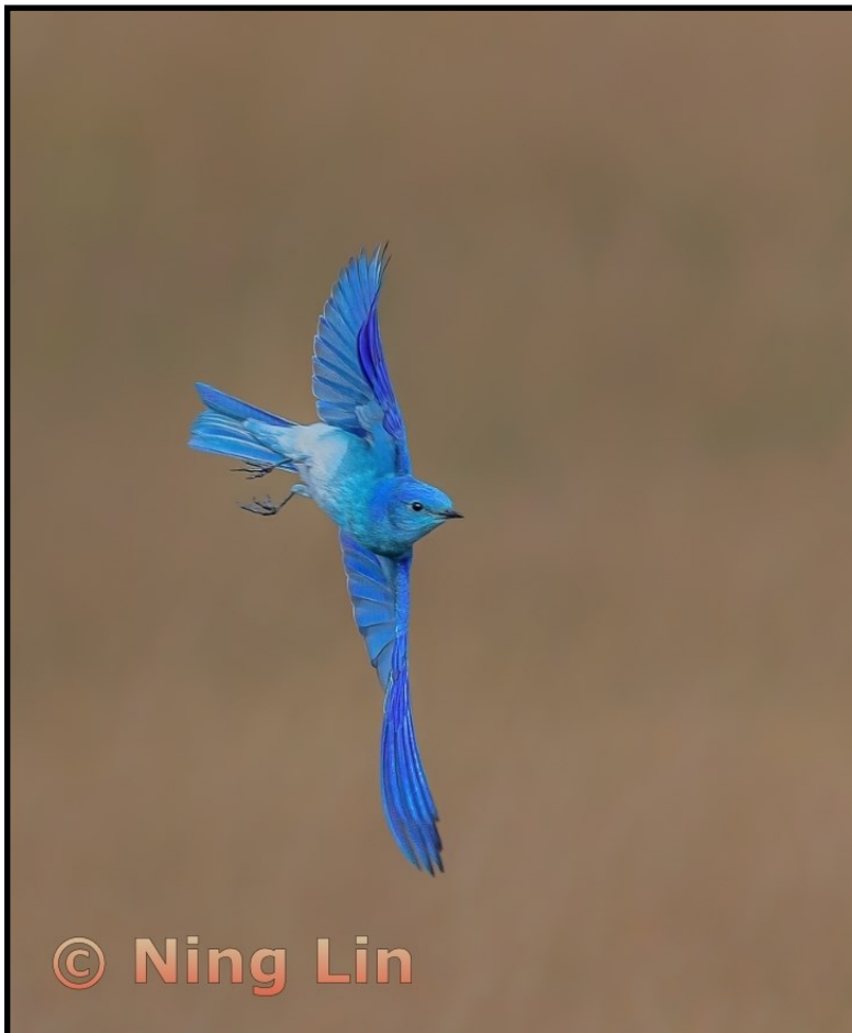
Mountain Blue Bird by Ning Lin