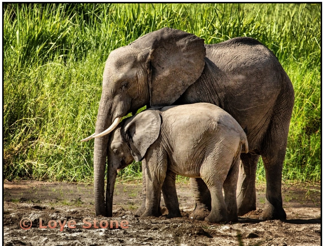
Mother and Child Tanzania Africa by Loye Stone PPSA