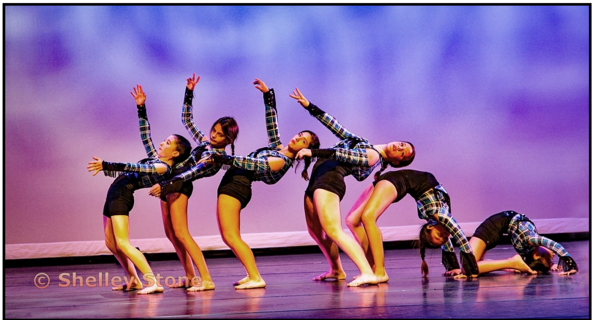
Fresno Youth Dance Troup