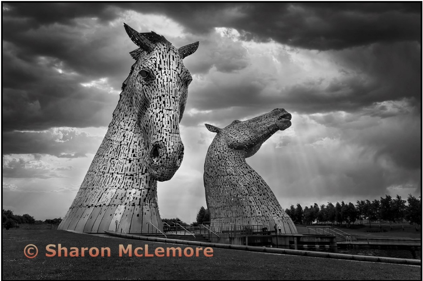
The Kelpies near Edinburgh Scotland