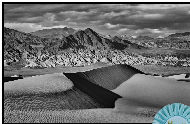
Distant Clouds Over the Dunes By Loye Stone, PPSA