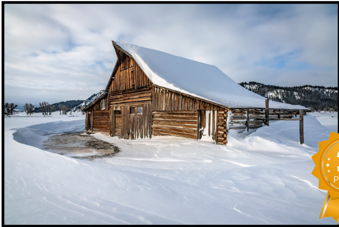
Winter at the TA Moulton Bar