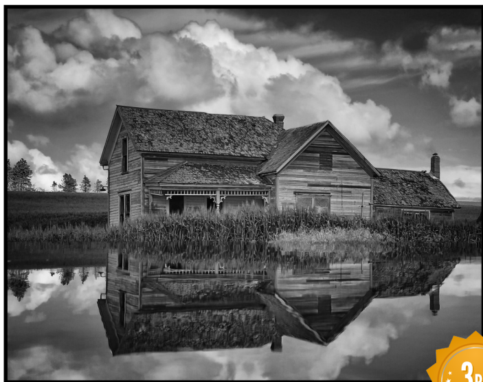
Abandoned House After Rainstorm