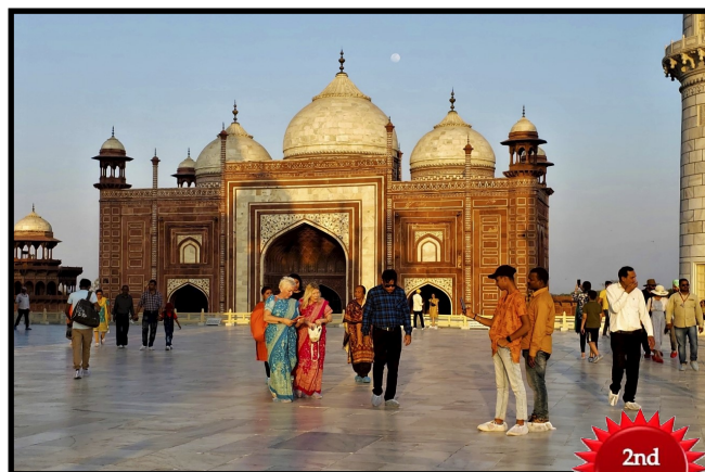
Last Light Taj Mahal Complex Agra India by Sara Danville