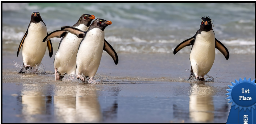
Rockhopper Penguins Returning from Sea