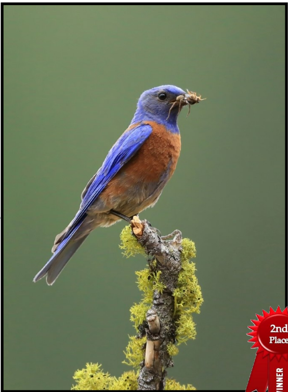
Male Western Bluebird with Insects