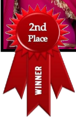
Fun With Friend