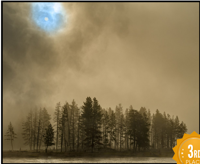
Sunrise on the Yellowstone River