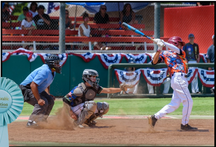
Foul Ball