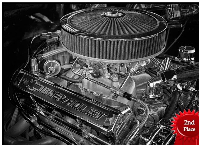
Chevrolet Engine