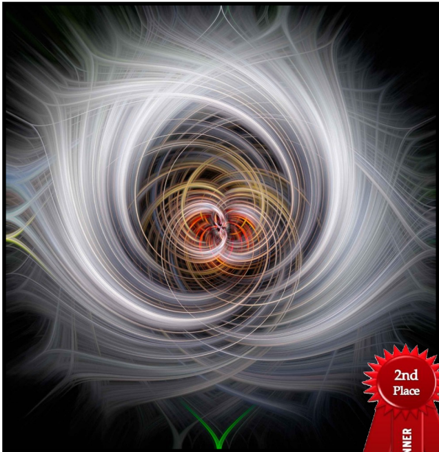
Dandelion Seed Head (Taraxacum)