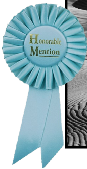
Morning Shadows by Dee Humphrey