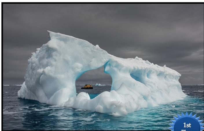
The Window of Antarctica By Ning Lin