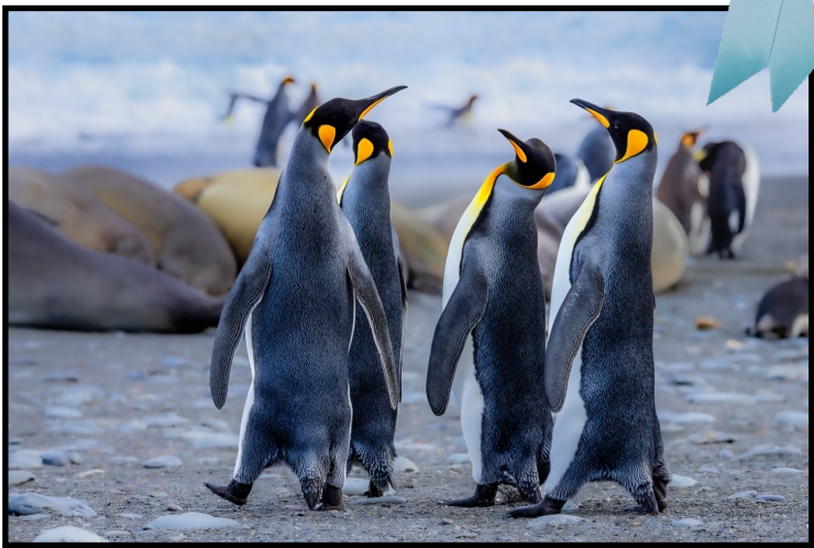
King Penguins at South Georgia Island by Ning Lin