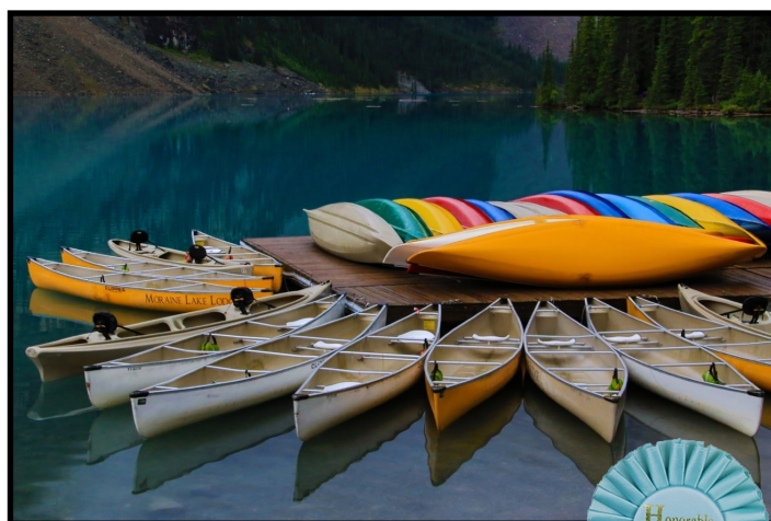
Moraine Lake Canoes 2